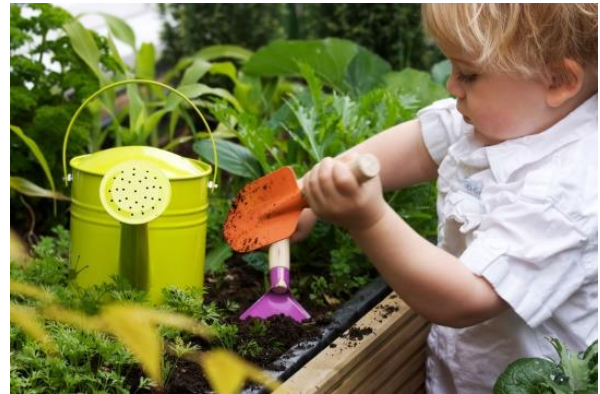
Image: Child using shovel in dirt for planting and a watering can.

***We will also be sending dirt, a pot and seeds home after the parent event.***